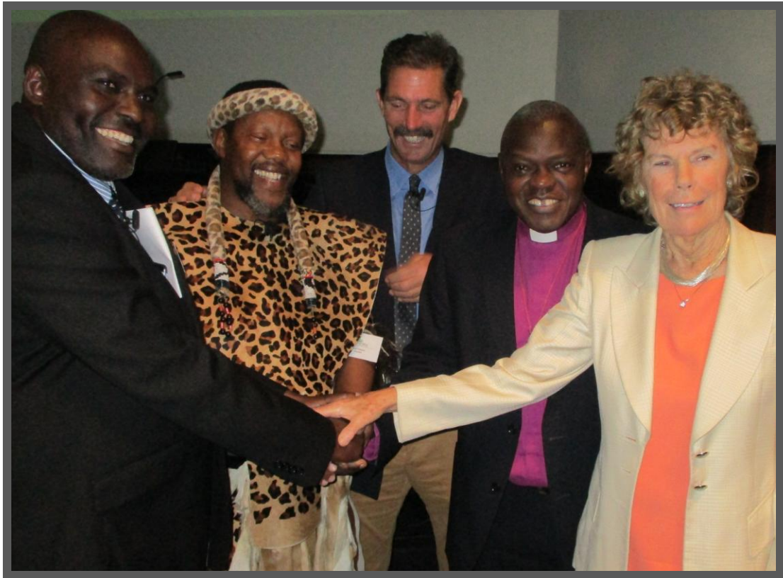
Four of the speakers with event chairman, The Hon. Kate Hoey, MP