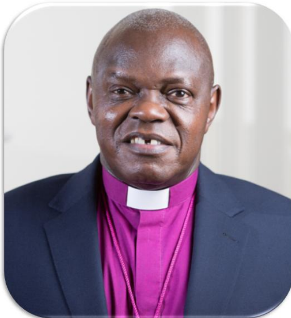
Dr John Sentamu Archbishop of York

Regrettably Fergal Keane was sent to South Africa on an assignment and was unable to attend the event, so he recorded his presentation which was screened during the programme