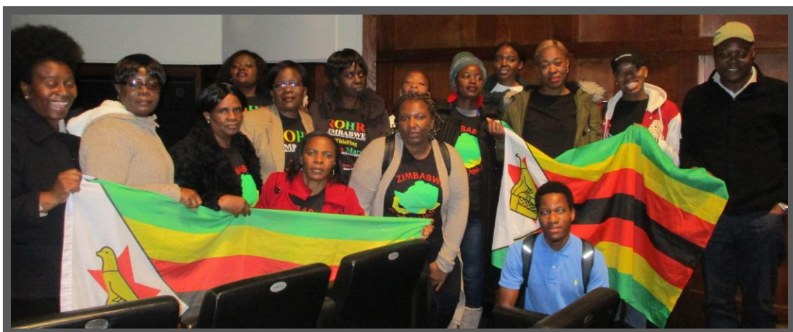
Members of Restore Human Rights (ROHR) Zimbabwe

Restoration of Human Rights (ROHR) Zimbabwe is a non-political organisation whose members are committed to bringing about change in Zimbabwe.