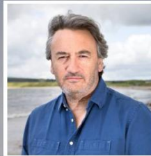
Fergal Keane OBE BBC Africa Correspondent