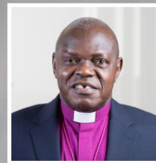
Dr John Sentamu Archbishop of York